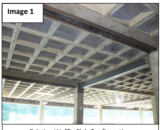
Existing Waffle Slab Configuration

The existing building slab has a waffle configuration as seen in Image 1. This type of slab was difficult to work with throughout the construction process since it is an outdated type of configuration. The challenges associated with this slab were the limited penetration/cutting of structural ribs at waffle units, as recommended by the structural engineer. Since the contract documents were not coordinated between core drill locations (for plumbing and electrical through slab penetrations) and waffle slab rib locations, this presents a coordination issue. In order to mitigate this issue the project team performed an extensive analysis on the slab to