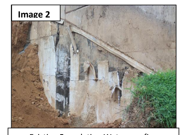
Existing Foundation Waterproofing

investigate adding this activity to the initial schedule would have helped. The task posed a problem mainly because of the hectic time it was added as an additional scope of work. An analysis could incorporate the waterproofing activity into the initial project schedule. This would allow for consideration of site logistics, since coordinating with other project tasks was not executed because the waterproofing needed to take place immediately. Also, having the knowledge of this need for waterproofing from the start of the project could allow for weather considerations to be taken into account. Performing waterproofing in